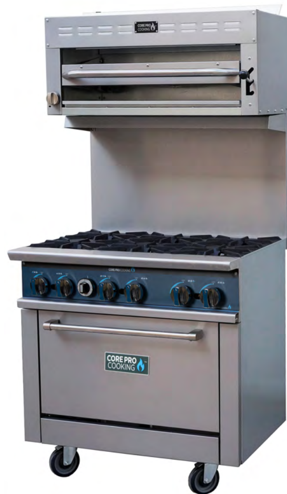
CP-SM-36 MOUNTED ON BACK RISER OF CP-R36 RANGE (SHOWN WITH OPTIONAL CASTERS)